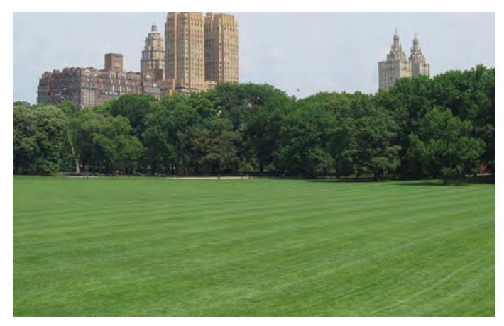
The Great Lawn at Central Park

6) The Bronx Botanical Gardens (a National Historic Landmark and one of the greatest botanical gardens in the world, with its diverse landscape and extensive collection of plants and gardens).