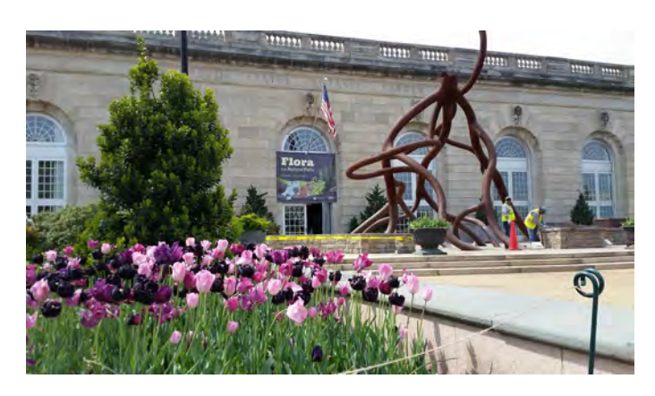
The United States Botanic Garden

adjacent to the U.S. Capitol, was established more than 200 years ago by President George Washington whose vision for the capital city of the United States included a botanic garden that would demonstrate and promote the importance of plants to the nation. Established by the U.S. Congress in 1820, the U.S. Botanic Garden is one of the oldest botanic gardens in North America. A 45-minute guided tour of the U.S. Botanic Garden Conservatory will be followed by an opportunity for attendees to visit the adjacent National Garden and Bartholdi Park.