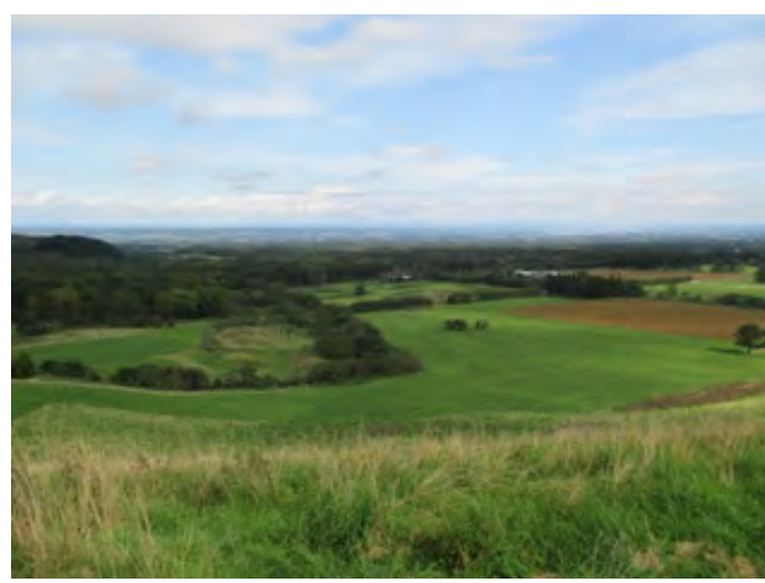
Earth Garden at Tokachi Millennium Forest

At Memuro Park, there are dozens of big Japanese emperor oak trees. Some of the trees are over 350 years old and as old as the history of the development in Hokkaido. However, these heritage trees are in danger because of environmental changes caused by the park improvement construction including planting turf. The trees and the turf, their coexistence is a challenge.