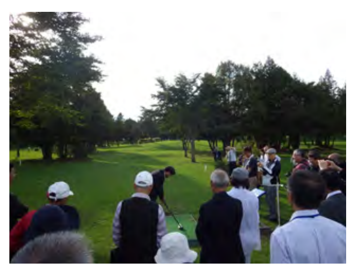
Park golf which was invented in Makubetsu-cho, Hokkaido.

Tokachi Millennium Forest has beautiful award-winning gardens. The Forest was established on the idea of "carbon offset," an environmental conservation activity to reduce greenhouse gas emissions. The Park golf site was invented in Makubetsu-cho, Hokkaido. All you need to play park golf is one club, a ball and a tee. Everyone from children to elderly people can enjoy this community sport. It is becoming very popular in the Hokkaido area specially, so now it has spread to of all Japan including Okinawa, the southern part of Japan.