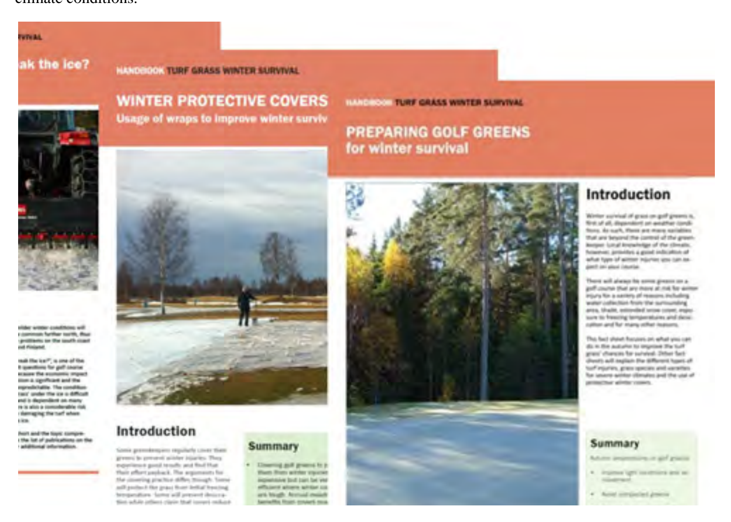
Figure 1. Ten new fact sheets about turfgrass winter stress management are available at <a href="http://www.sterf.org/sv/library/fact-sheets-winter-survival">http://www.sterf.org/sv/library/fact-sheets-winter-survival</a>

The research programme and information about on-going research projects within winter stress management can be found at <a href="https://www.sterf.org">www.sterf.org</a>.