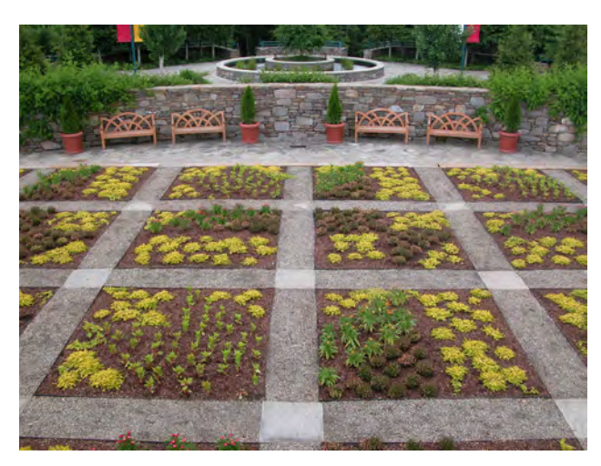
The Gardens at Biltmore Estate