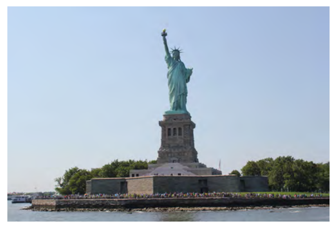
The views from the cruise

Immediately following the ITS Quadrennial Business Meeting and the Graduate Student Awards Presentations on Thursday, 20 July, attendees will board buses for a night on the town featuring a Twilight Dinner Cruise of the NY/NJ Harbor and Statue of Liberty, with awesome views of the New York City Skyline, great food and dancing. This is a once in a life-time event that your entire family will want to see.