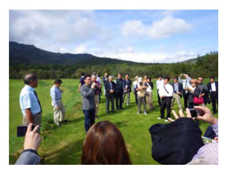
Welcome message by the president of Tokachi-Mainichi Press at Tokachi Millnnium Forest

On the second day of the meeting, we visited turfgrass sites around the Obihiro area and these were as follows: 1) Obihiro Forest Park, 2) Memuro Park, 3) Tokachi Millennium Forest, 4) Park Golf site at Makubetsu-cho, and 5) Tokachi Ecology Park.