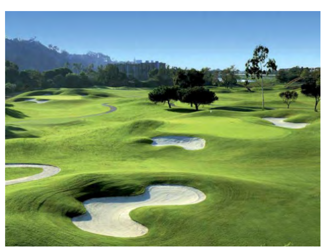
The Biltmore Forest Club

significant role in the distinguished social history of Asheville and the Carolinas. Mrs. Edith Vanderbilt was instrumental in acquiring the land for the town of Biltmore Forest from the Biltmore Estate in 1920. Included was a site for a country club, and construction began the following year. The club has undergone many changes and renovations over the years with the most recent being a 6.4 million dollar restoration of the golf course, including new 'A-1' creeping bentgrass greens and 'Zeon' zoysiagrass tees and fairways, all established by sod, and an 1.8 million dollar restoration of the clubhouse.