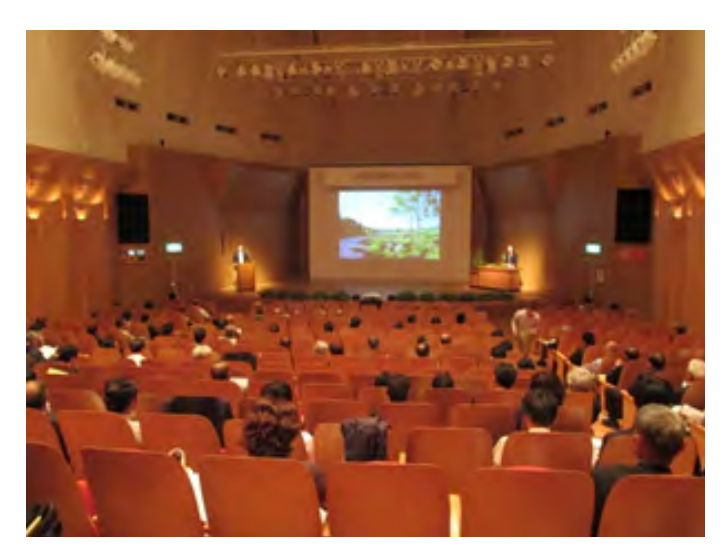
2016 fall annual meeting in Obihiro, Hokkaido

The morning session on the first day at the fall annual meeting had four separate meeting groups. These groups included golf courses, ground cover plants, school turf, and parks. For the afternoon session, the general meeting and keynote lectures were held. The keynote lecture speakers and their titles were as follows: