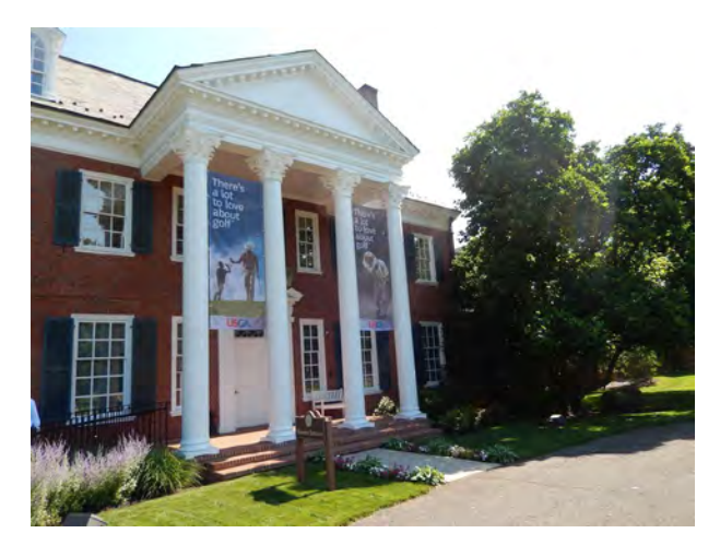
The USGA Museum / Testing Facility