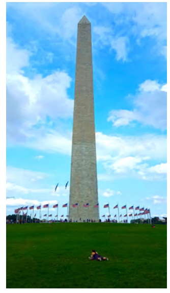
The National Monument

on the once-grassy lawn which extends from the Lincoln Memorial to the U.S. Capitol Building. In response, the National Park Service has just completed a massive restoration project. The turf restoration project was designed to create a healthy and water efficient landscape. All aspects of this restoration will be discussed on our tour by a representative from the National Park Service.