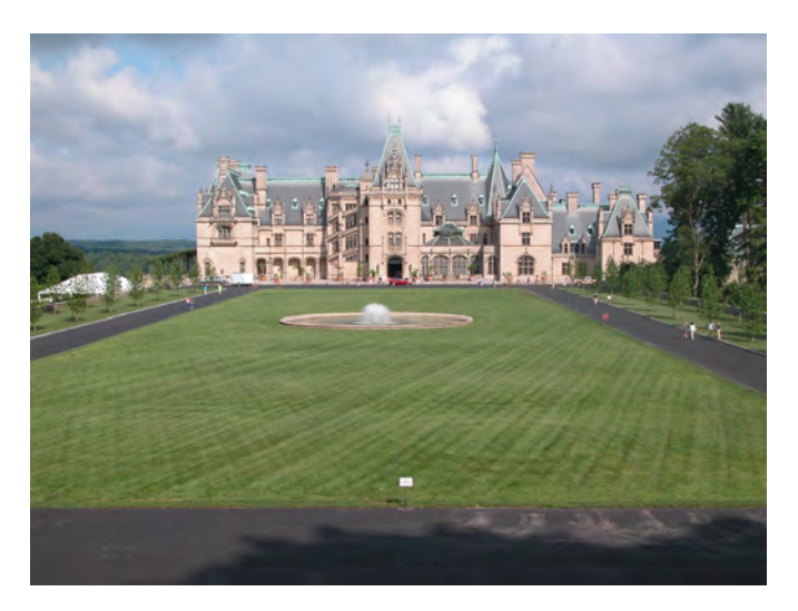
The Biltmore House