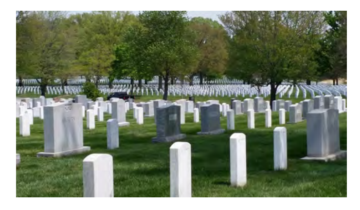
Arlington National Cemetery

Arlington National Cemetery is a lasting tribute to the men and women who made the ultimate sacrifice while serving our nation. This hallowed ground is where more than 400,000 United States service men and women and their family members are laid to rest.